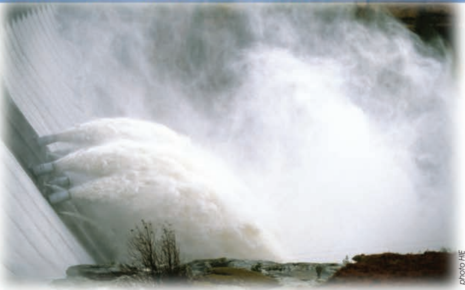
The hydro electric water dam at Laggan, near Kingussie, as water is released safely.