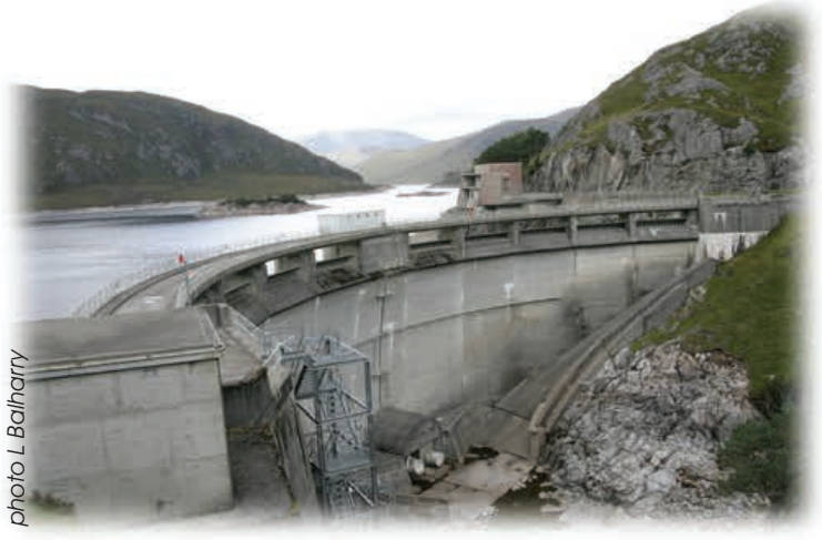
The dam at Loch Monar, Glen Strathfarrar, near Loch Ness.