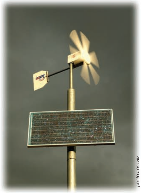
Solar panels come in all different sizes! A solar panel and wind turbine have been installed at Holm Primary School, Inverness. They supply energy to a school computer.