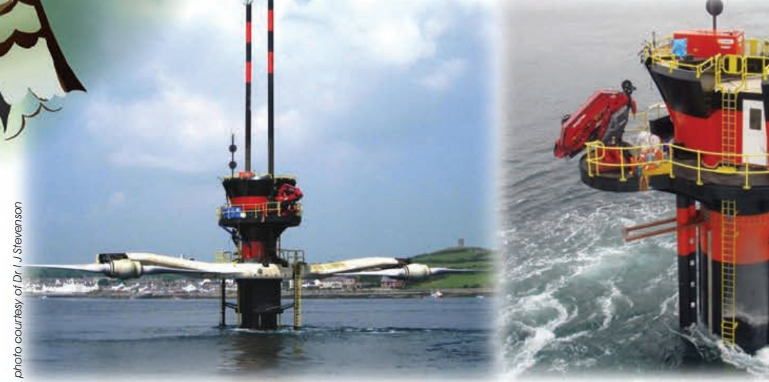
A SeaGen tidal current turbine feeling the flow of the current.